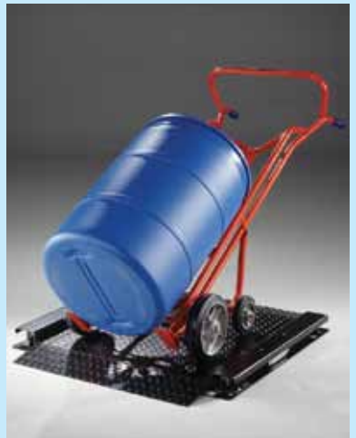
Ultra-low profile makes it easy to wheel heavy containers onto the scale.