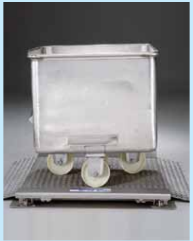
Choose from 304 or 316 stainless steel for the level of corrosion resistance you need.

At the heart of each scale is our VERTEX® Scale Engine. It consists of the load cells and the suspension system that transmits weight from the platform to the load cells. We design scale components to perform reliably, without the need for adjustment. And we test our products extensively to ensure that you get a scale you can count on. Take a look at what makes our scales different: