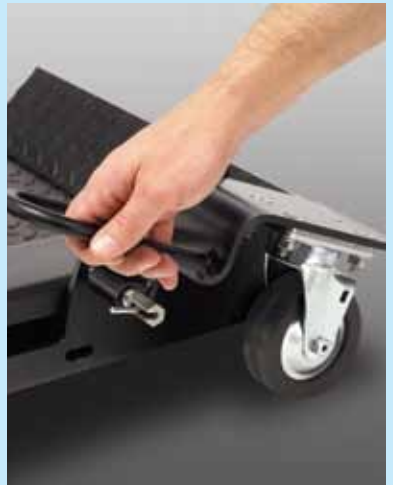
Portable 30x30-inch scale fits easily through standard doorways. Hinged ramps fold out of the way when scale is moved or stored.