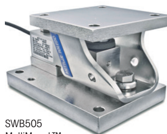
SWB505 MultiMount™ (Analog)

SWB605 PowerMount™ monitors single load cells for overload, zero drift, foundation problems, etc.; prompting action before system shuts down or measures incorrectly.