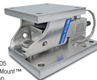
SWB605 PowerMount™ (Digital)