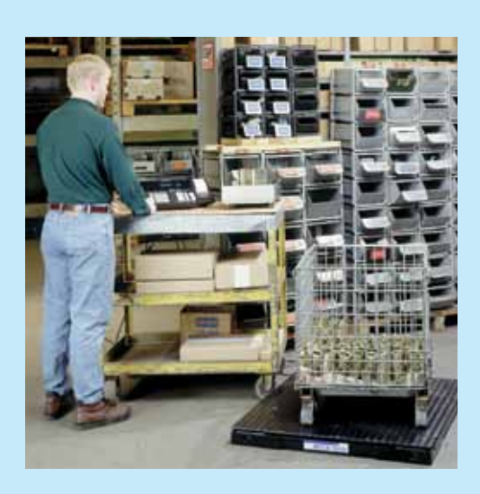
VERTEX scales are ideal for high-precision, heavy-capacity counting applications.