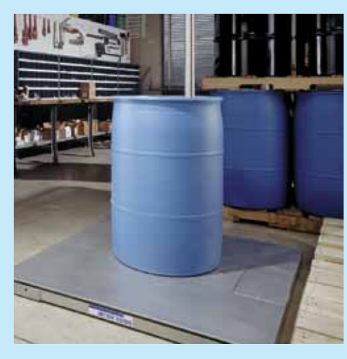
VERTEX scales provide the dependable repeatability needed for batching and filling.

VERTEX scales are NTEP certified for 5,000-division accuracy. For applications that require a higher level of performance, we offer versions of these scales with 10,000-division accuracy. We can provide a factory test loading report verifying 5,000-division accuracy or 10,000-division accuracy (not legal for trade).