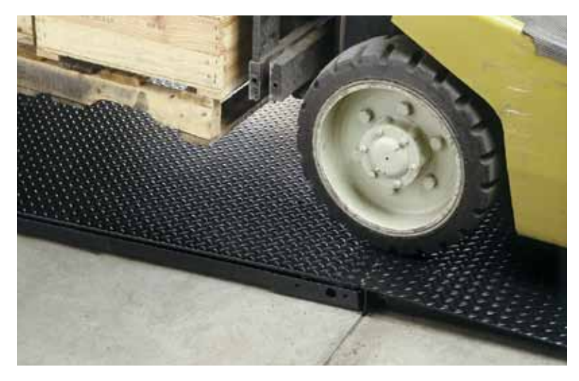
The scales are designed for 100% end loading to handle forklift traffic.