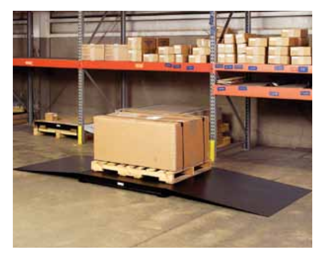
The PFA261 floor scale is ideal for pallet loading and general weighing in shipping, receiving, and manufacturing applications.