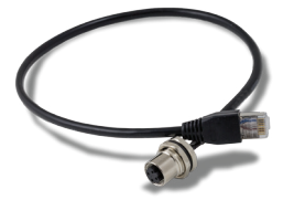
Ethernet Extension Kit [30139562]