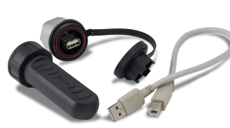
USB Extension Kit [301139560]