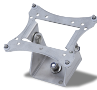
Positionable Bracket [22015188]