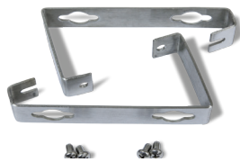
Wall Mounting Brackets [Included with harsh terminal]